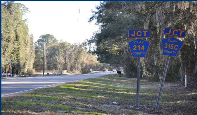
The road will be improved from C.R. 315C to S.R. 100.